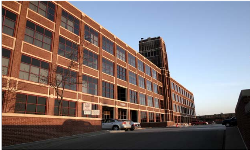
2550 University Avenue West, St. Paul, MN 55114