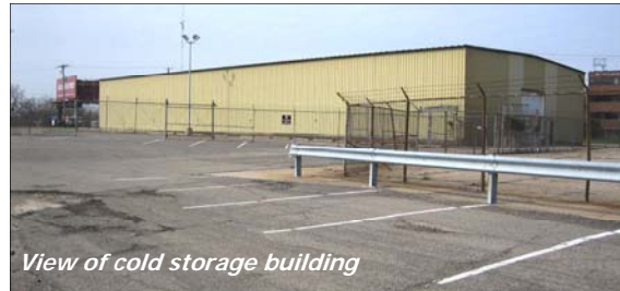
View of cold storage building

Both buildings sprinklered, Fully fenced property, MTC Bus service nearby, 2 blocks to new LRT station