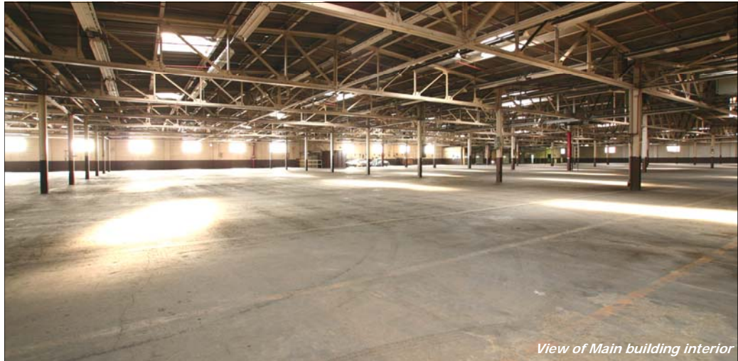
View of Main building interior