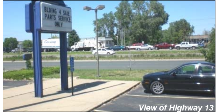
View of Highway 13

Highway 13: 61,000 vpd Highway 5: 21,700 vpd